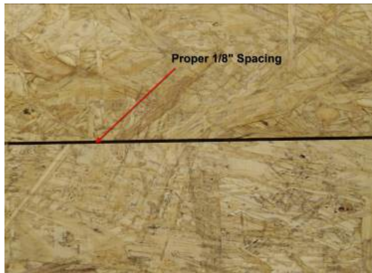
Correct installation of Advantech T&G Edge

FORCING T&G EDGES TO FIT TIGHTLY TOGETHER CAN DAMAGE THE PANELS AND VOID THE WARRANTY. T&G EDGES ARE DESIGNED TO FIT TOGETHER EASILY WHILE PROVIDING THE INDUSTRY STANDARD 1/8" GAP BETWEEN PANELS.