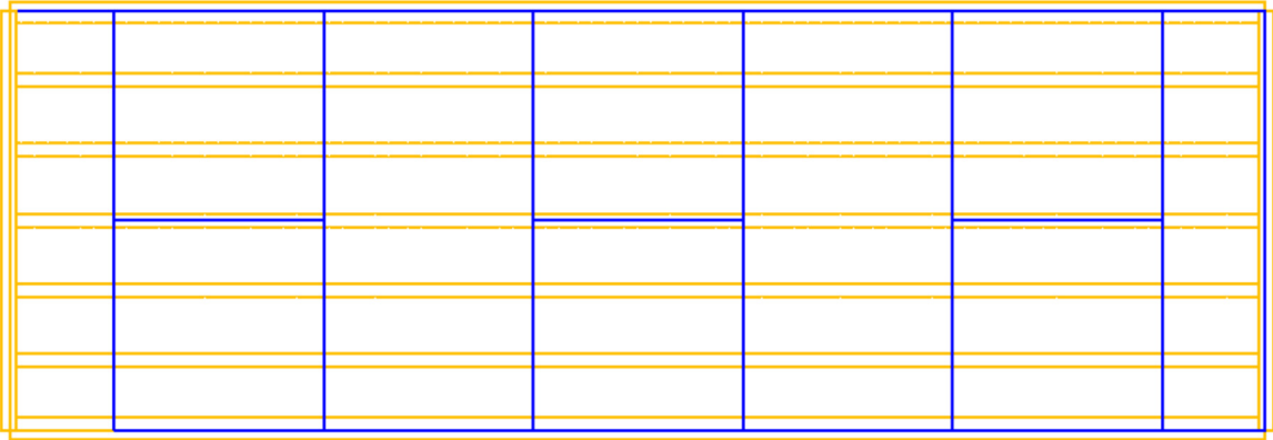
Figure 2: Sheathing Orientation for Force Applied Perpendicular to Joists