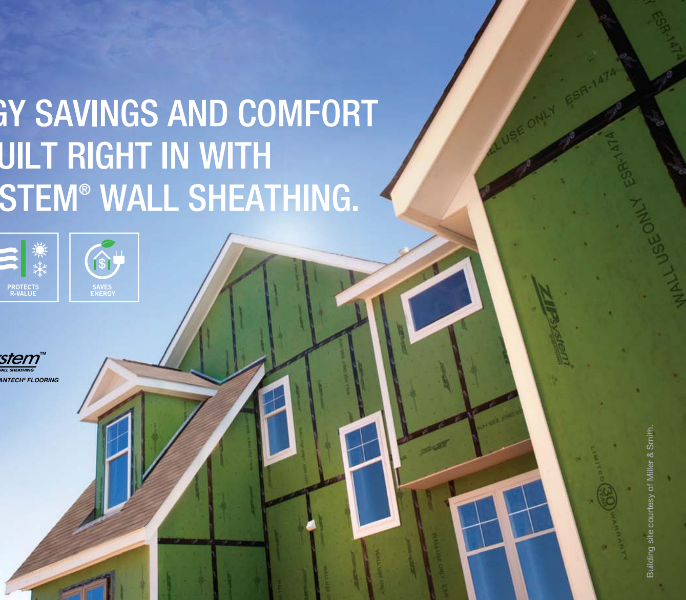
Building site courtesy of Miller & Smith.

ZIPsystem™ ROOF & WALL SHEATHING FROM THE CREATORS OF ADVANTECH® FLOORING