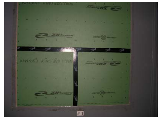
Figure 1. ZIP System wall assembly in E 283 test chamber.

In this test, separate 8ft by 8ft walls were constructed according to specific manufacturer’s installation instructions. ZIP System wall sheathing and tape were installed on studs as one wall assembly and a standard housewrap and housewrap tape were installed over osb wall sheathing on the other assembly. The wall sections were placed one at a time into an ASTM E283 air-tightness test chamber and sealed to the chamber on all sides. For both assemblies, the panel area and the top and bottom connections were sealed as per the manufacturers’ prescribed methods for creating an air barrier. Positive and negative pressures were applied to the assemblies to simulate real life wind loading. Air flow (leakage) readings were captured at various pressures.